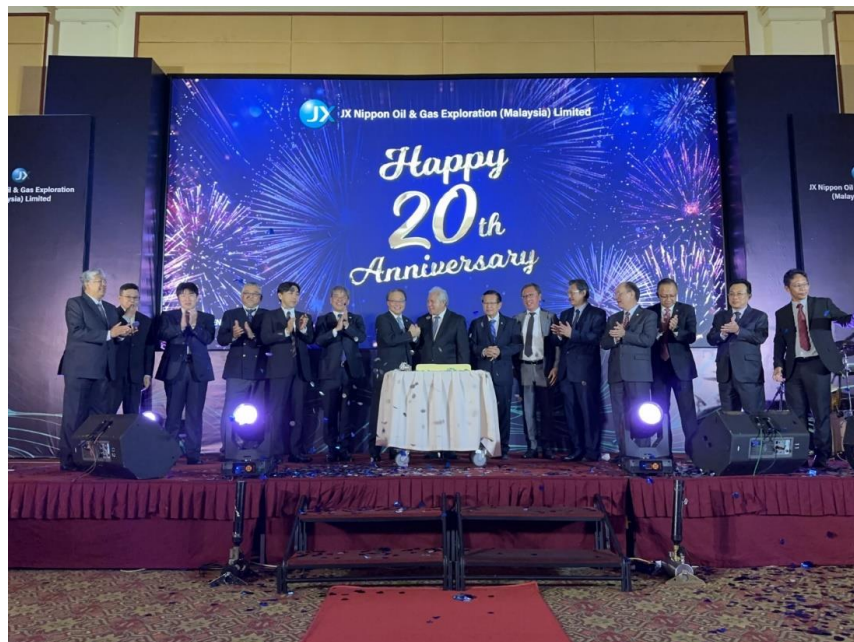
Cake Cutting Ceremony in Miri