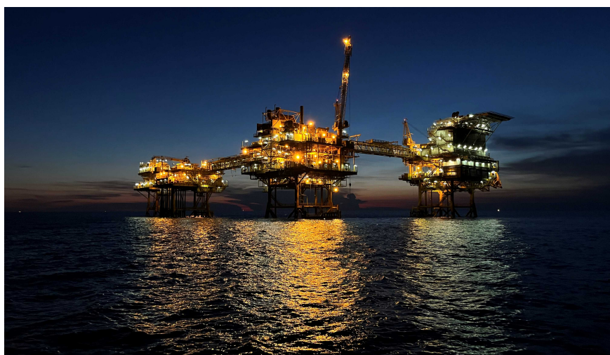
Rang Dong Oil Field in Block 15-2