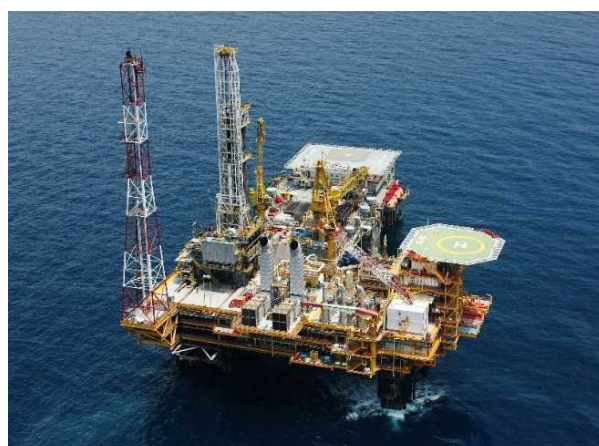
Block SK10 Map and Offshore Production Facility